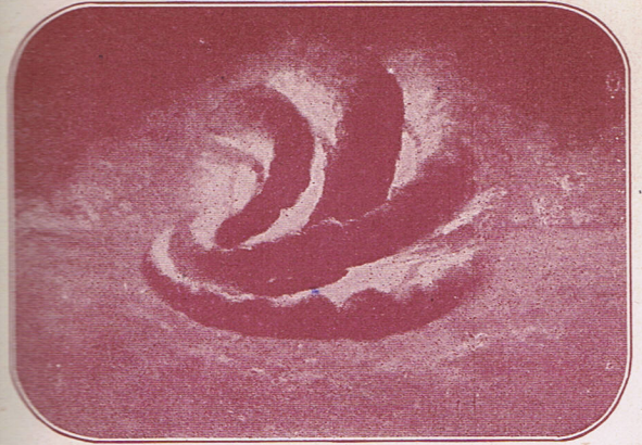
RINGS IN FORMATION

There are scientists who claim that the Earth still has one ring about it, an electrical ring which, falling, will in a few years destroy fermentation, microbes and parasites, and greatly assist plant and animal life.